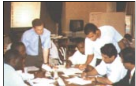
Workshop in progress during Roads and Transport course

All three courses will be held again in 1997.