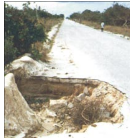
Collapse resulting from erosion of embankment

The draft guidelines will be available in 1997 for