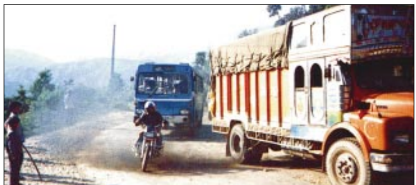
Typical black smoke emissions from diesel vehicle