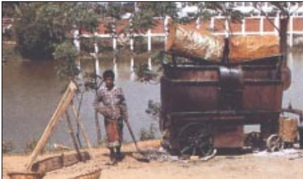
A bitumen heater being used for labour based roadworks

The aim of the workshop was the development of guidelines on specification,